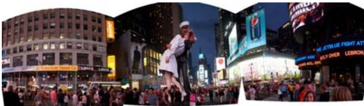
On the inaugural Spirit of '45 Day in 2010, thousands of people gathered around a giant Seward Johnson sculpture of the famous "kiss" seen around the world on August 14, 1945 that was brought in to New York's Times Square.