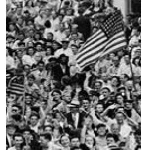
People everywhere celebrated "America's Greatest Day" on August 11, 1945

By remembering and reflecting upon the achievements of the generation that endured the difficult times of the Great Depression, defended freedom in WWII, and then went on to assure a better future for their children and their children's children, Americans of all ages can come together to renew our national spirit so that we can meet the historic challenges of our own time. It is especially important that the youth of America be involved in Spirit of '45 Day in ways that help inspire them to contribute to making the world a better place in their lifetime.