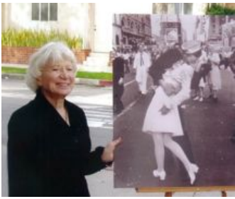
Edith Shain, the famous "Times Square Nurse"