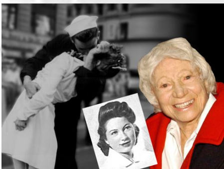
Dedicated to Edith Shain July 29, 1918 - June 20, 2010