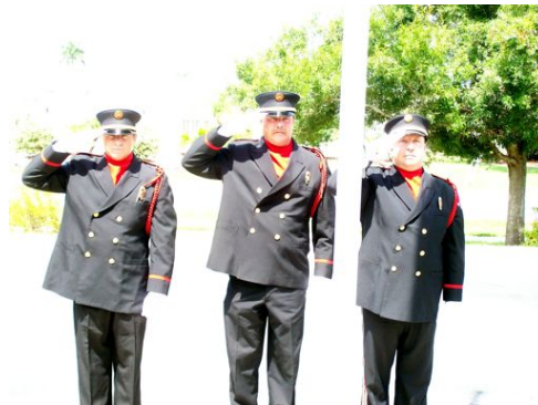
CCFD Honor Guard

I am asking you please take the time to honor our Veterans, by helping to get their stories down before they are gone. We are still working on collecting up towards 100,000 stories to archive online at www.spiritof45.org . Once this generation has passed, all we will have is their memories.