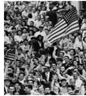
People everywhere celebrated “America’s Greatest Day” on August 14, 1945

“Keep the Spirit of '45 Alive!” is a nationwide, grassroots, nonprofit initiative to establish an annual day to honor the achievements of what is often referred to as America’s ‘greatest generation’ so that their example of courage, self-sacrifice, service and national unity will forever inspire future generations of Americans - especially our youth.