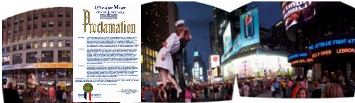
In New York City, Mayor Michael Bloomberg issued a proclamation and crowds gathered around a 25 ft. statue of the famous Times Square Kiss to officially kick off the first National Spirit of '45 Day on August 14, 2010, which was cited in more than 15,000 media outlets across the country and internationally.

Senior living communities held open houses to honor their WWII era residents, youth groups organized oral history projects, history museums and WWII heritage associations sponsored public events, and veterans groups organized wreath laying ceremonies featuring performances of “Amazing Grace” and “Taps” to honor the more than 400,000 who lost their lives in WWII and the millions who have passed away since the end of the war.